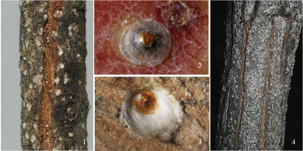
Figures 1-4: (1) Diaspidiotus perniciosus causing drying out and bark splitting to Cotoneaster . (2) Diaspidiotus perniciosus female scale. (3) Pseudaulacaspis pentagona female scale. (4) Pseudaulacaspis pentagona causing bark splitting and dieback to Morus sp.

and WILLIAMS & WATSON (1988a, b & 1990). Nymphal stages were identified by comparison with verified material deposited at The Food and Environment Research Agency (Fera). The nomenclature used follows BEN-DOV et al. (2010). Slide-mounted specimens have been deposited at Fera and AGES.